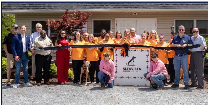
Staff and local community leaders gather to celebrate Altavista Animal Clinic's ribbon cutting May 15.